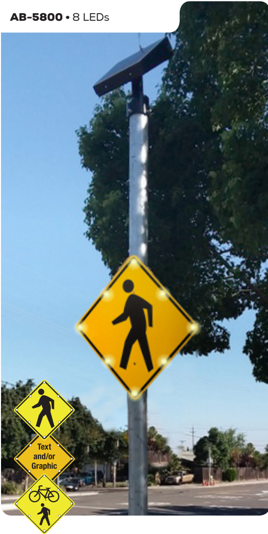
AB-5800 • 8 LEDs